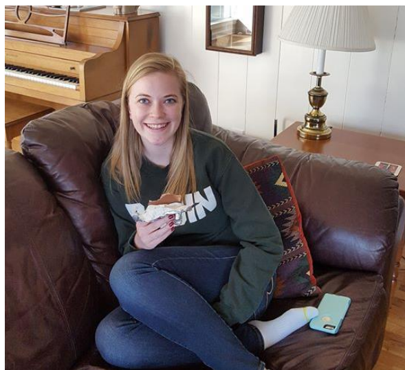
In my natural habitat: eating an ice cream bar

You can now make online donations to Project RETURN. To make a donation, visit our website at www.projectreturnmilwaukee.org